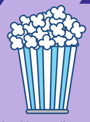
Ends Friday, April 21st

Flyers for the popcorn sale will go home with students on April 6th. Sale will run until April 21st. All students who sell at least 1 item will get to enjoy an ice cream treat after lunch in May. Top sellers per grade will win a $25 Corner Ice Cream gift card. The overall top seller will win the Family Fun Night package which includes $25 gift cards to Corner Ice Cream and Freeway Lanes and a $50 gift card to Skyway Drive In & Laser Tag. Pick up is scheduled for May 9th.