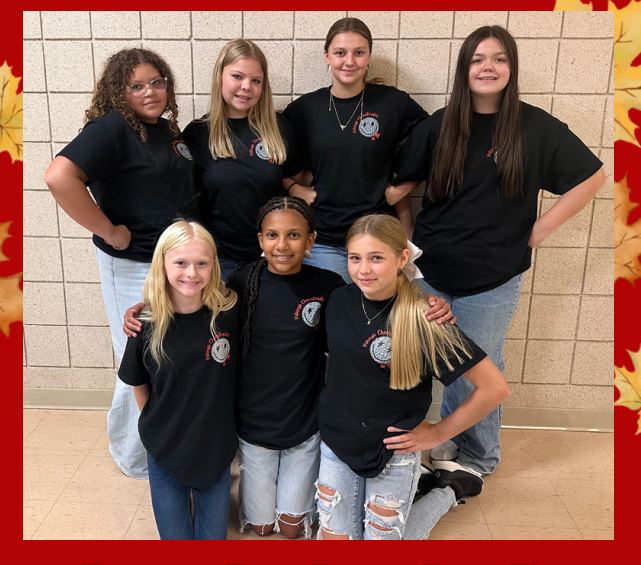
7th Grade Cheerleading