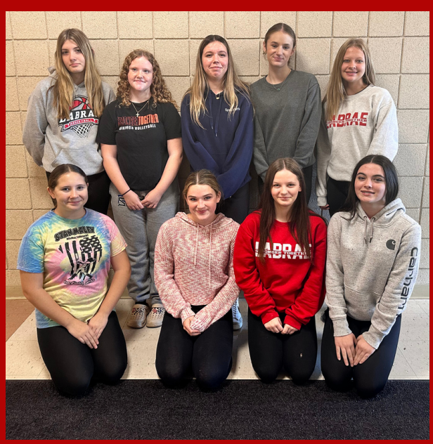
8th Grade Volleyball