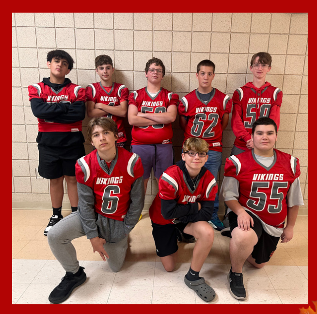
8th Grade Football