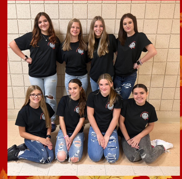
8th Grade Cheerleading