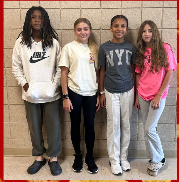
7th Grade Volleyball