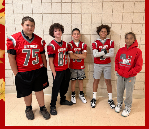
7th Grade Football