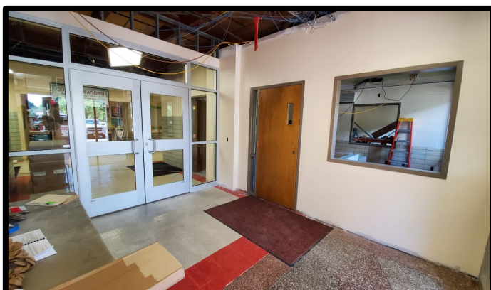
The newly designed security lobby of Bascom Elementary School construction being completed.

There were four contractors that bid the project. Bids ranged from a high of $192,943 to as low as $146,700. Murphy Contracting of Youngstown was the winning bidder as the firm came in approximately $30,600 less than the next highest bidder. Final expenses, which will include changes to specific designs in the original plan will result in a final price tag for the project of $156,000.