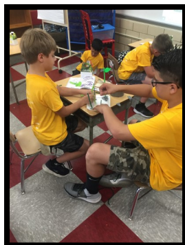
Camp Invention Inventors at work!

Later this fall, LaBrae will begin an after-school intervention program for all grade levels as another initiative to address learning loss. Information on the after school programming will be forthcoming to parents in September.