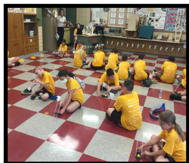
Camp Invention participants experimenting with their product designs.