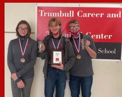
Prep Bowl Champs ..... p. 3, 4