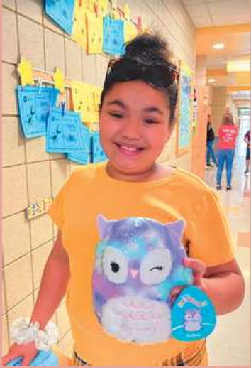
Friday Viking Store - Redeeming Vouchers