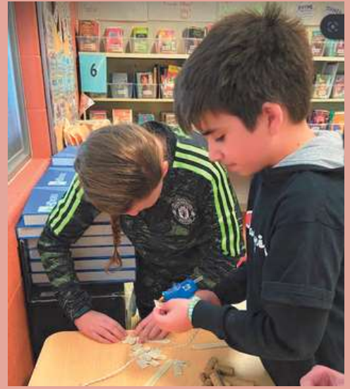
Grade 5 Aztec Floating Gardens